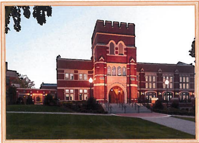
Commercial/Institutional Ruane Center for the Humanities Sullivan Buckingham Architects with The S/L/A/M Collaborative